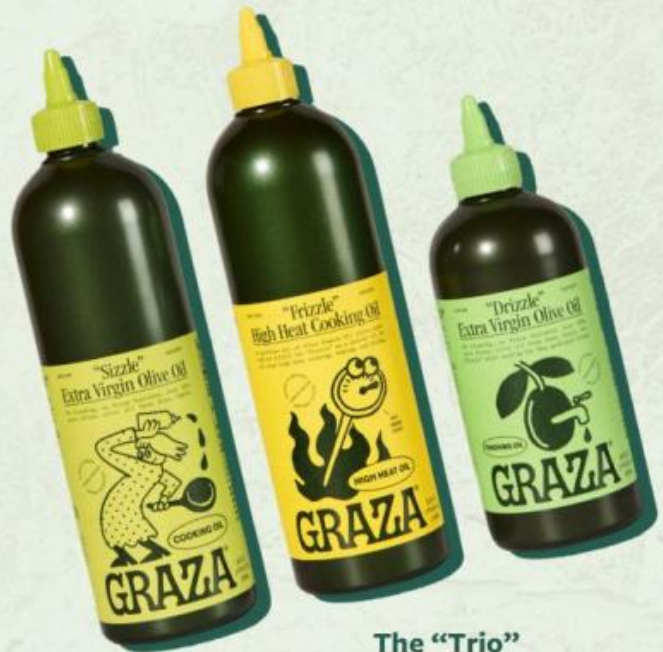
The "Trio" Sizzle, Drizzle, & Frizzle Set Graza $53