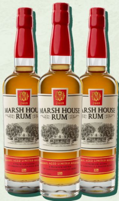
Limited Release Barrel-Aged Rum Marsh House Rum $48.99