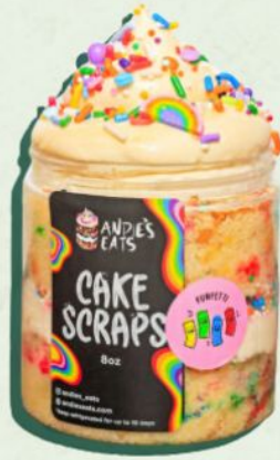
Funfetti Cake Scraps Andie's Eats $12