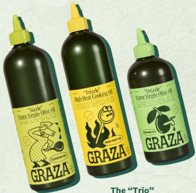
The "Trio" Sizzle, Drizzle, & Frizzle Set Graza $53