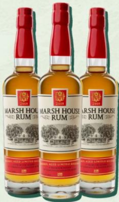
Limited Release Barrel-Aged Rum Marsh House Rum $48.99