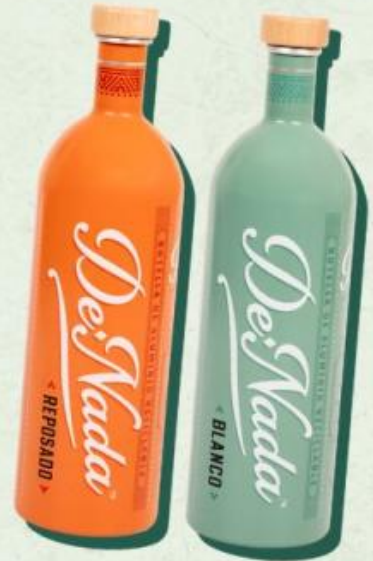
Tequila Bundle De Nada Tequila $87.98