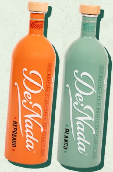
Tequila Bundle De Nada Tequila $87.98