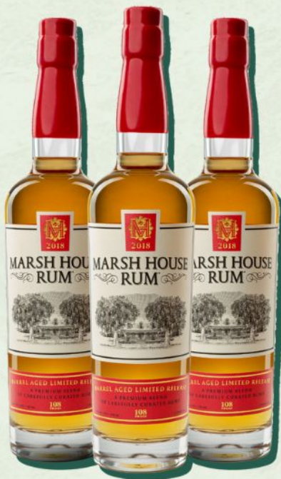
Limited Release Barrel-Aged Rum Marsh House Rum $48.99