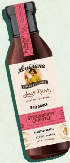
Strawberry Chipotle BBQ Sauce Louisiana Pepper Exchange $9.99