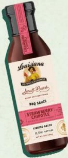
Strawberry Chipotle BBQ Sauce Louisiana Pepper Exchange $9.99